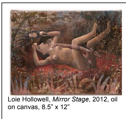
Loie Hollowell, Mirror Stage , 2012, oil on canvas, 8.5" x 12"