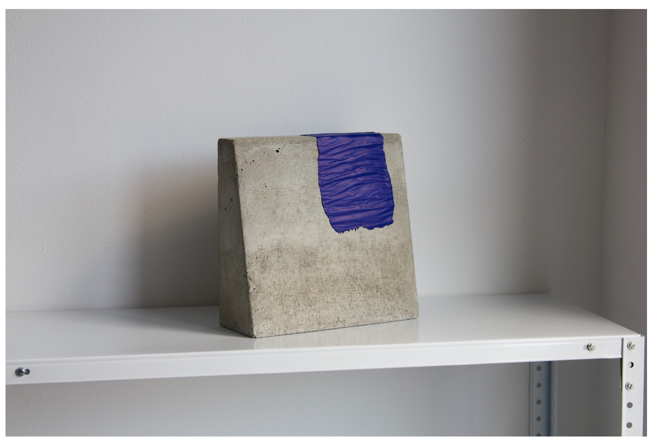
Untitled (2014) Cement casting with silkscreen paint. 25 x 25 x 8 cm.